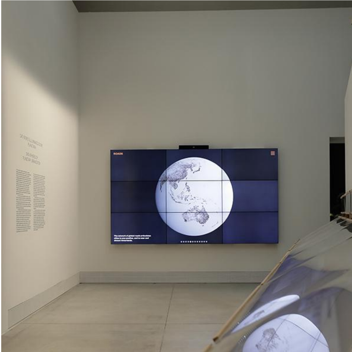
Still from Urban Theory Lab exhibition, "Visualizing Planetary Urbanization," Venice Biennale of Architecture, June 2020