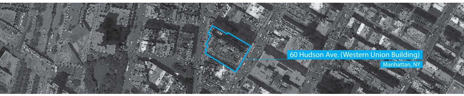
60 Hudson Ave. (Western Union Building) Manhattan, NY