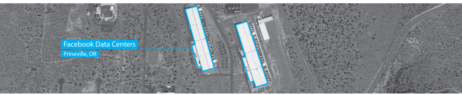
Facebook Data Centers Prineville, OR