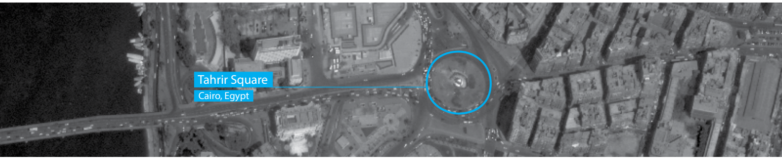
Tahrir Square Cairo, Egypt