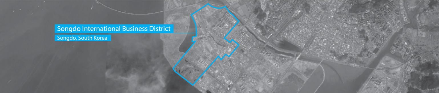
Songdo International Business District Songdo, South Korea