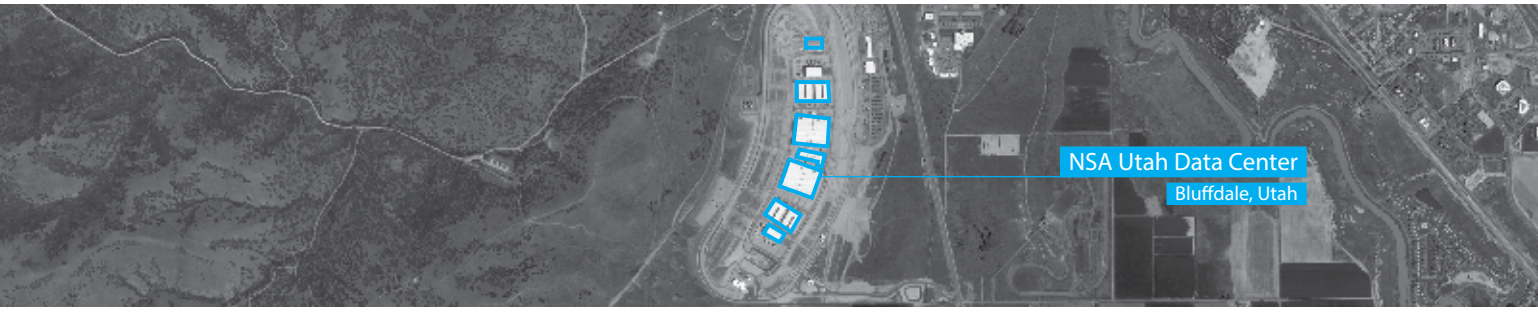
NSA Utah Data Center Bluffdale, Utah